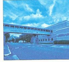
Back to School Fair