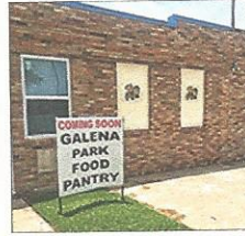
New Food Pantry