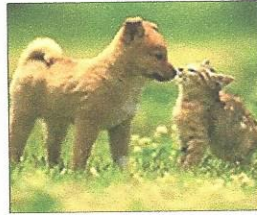
Pet Health Awareness